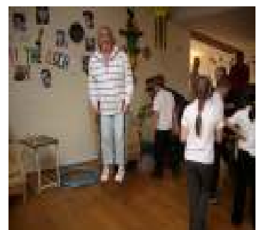
The Circus came to town